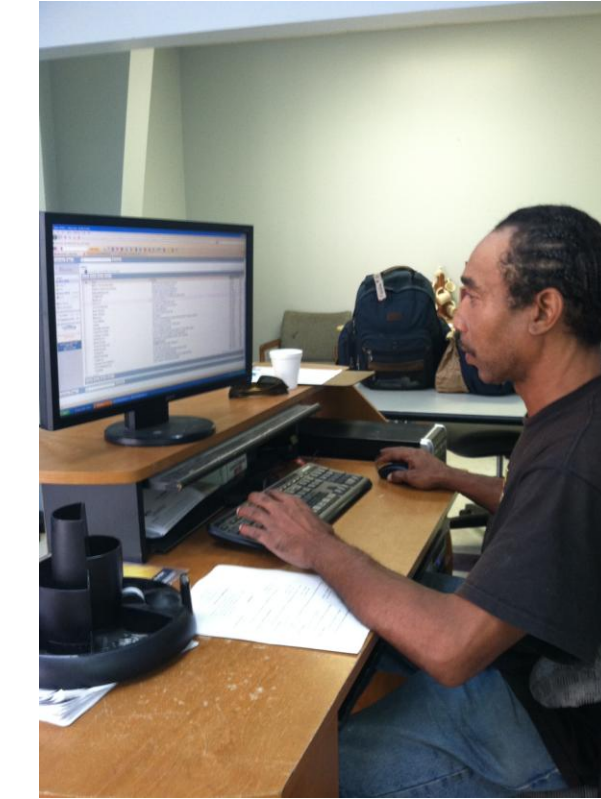
Client checking his email for job listings