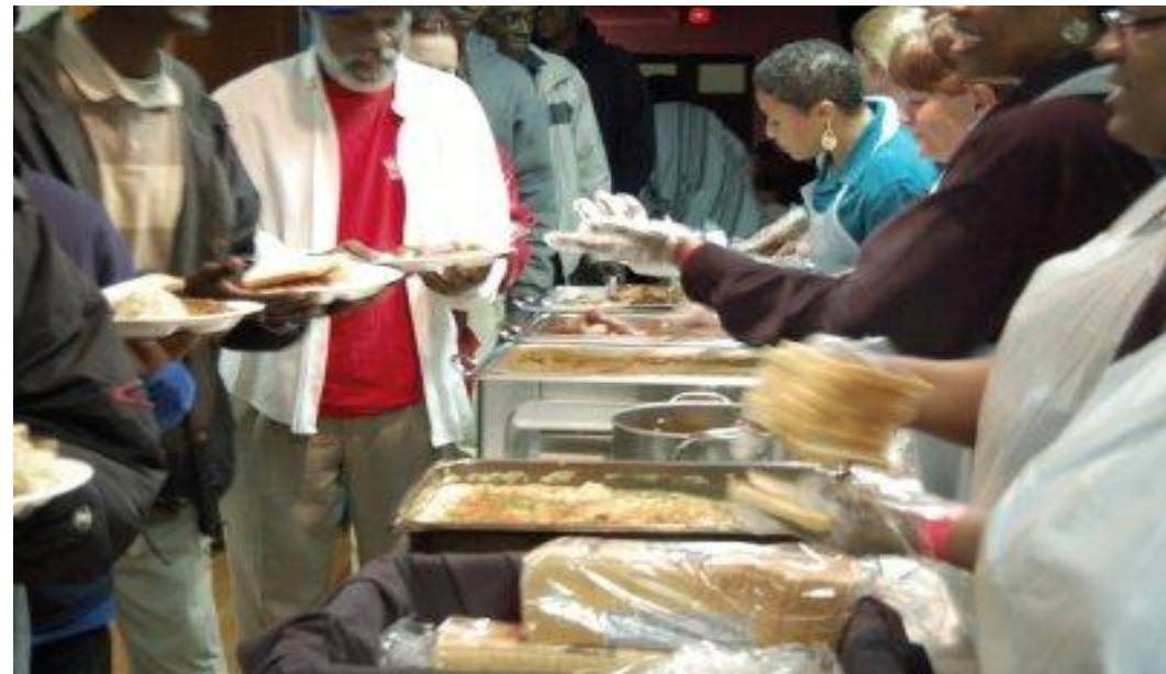
Clients being served dinner at Bread of Life.

At any given point in time there are over 10,000 homeless men, women, and children in Houston. Shelters, such as The Bread of Life, work to provide these individuals with a safe place to sleep, a shower, a hot dinner, and the opportunity to wash their clothes. To supplement these crucial services, we chose to provide the clients at The Bread of Life after Dark program with job readiness services. Overall, we served approximately 100 clients by providing them with professional resumes, email addresses, job search skills, and winning interviewing techniques.