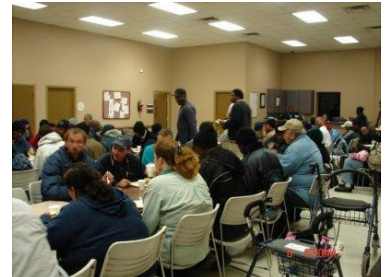
Clients eating and visiting at Bread of Life.